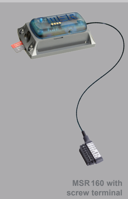
MSR 160 with screw terminal

Four analogue inputs, a high measurement rate and its gigantic memory capacity, all packed into a small format are the key characteristics of the new MSR 160 data logger. The analogue inputs of the robust mini logger can be used for conventional sensors with analogue outputs (e.g. CO 2 , conductivity, pH etc). In addition, a multiple output switching power supply is also provided.